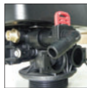
QC Drain Line