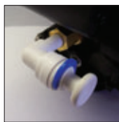
QC Brine Line