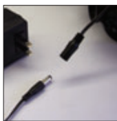
QC Power Cable