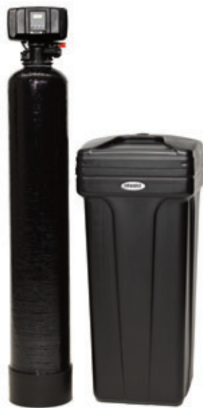
IWT 265 Water Softener

Hard water (calcium & magnesium) is a common problem for many homeowners and businesses. When hardness minerals are combined with heat it forms troublesome scale. Scale causes costly build-up in your plumbing, water heater and other water using appliances. When combined with soap, the minerals form soap curd or scum that makes skin dry and itchy, hair lifeless, laundry dull and builds up on fixtures.